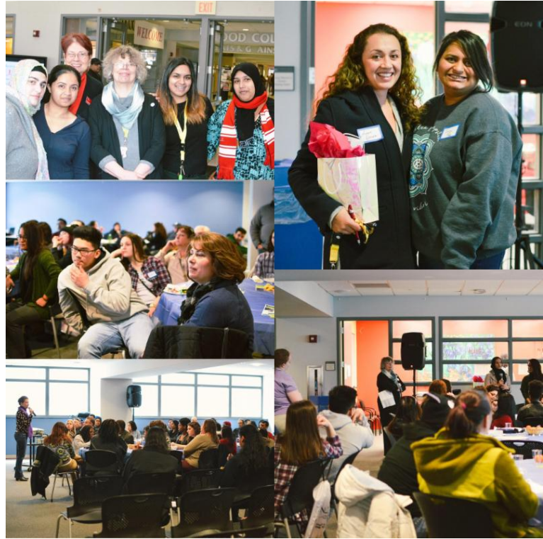
Highlights from the February 21st Open House