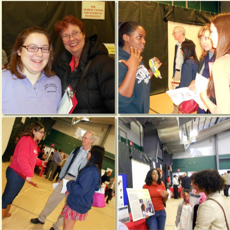
Murray Center Staff, Ambassadors, and students at the NJIT Open House