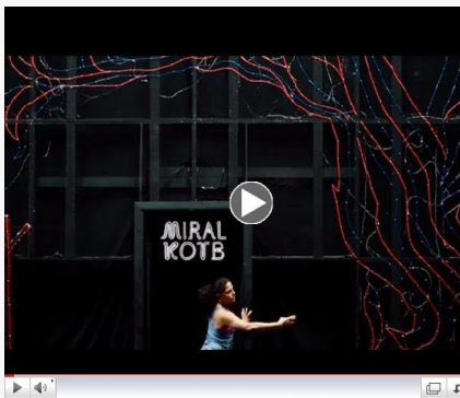
Made with Code - Miral

What happens when you cross a software engineer with a dancer? Miral Kotb is one very talented performer who also happens to code--with dynamic, innovative results.