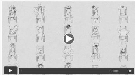
Why Do I Study Physics? (2013)

connecting today's women to tomorrow's opportunities